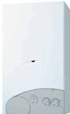
Sime wall hung boilers offer superior performance in a compact package.